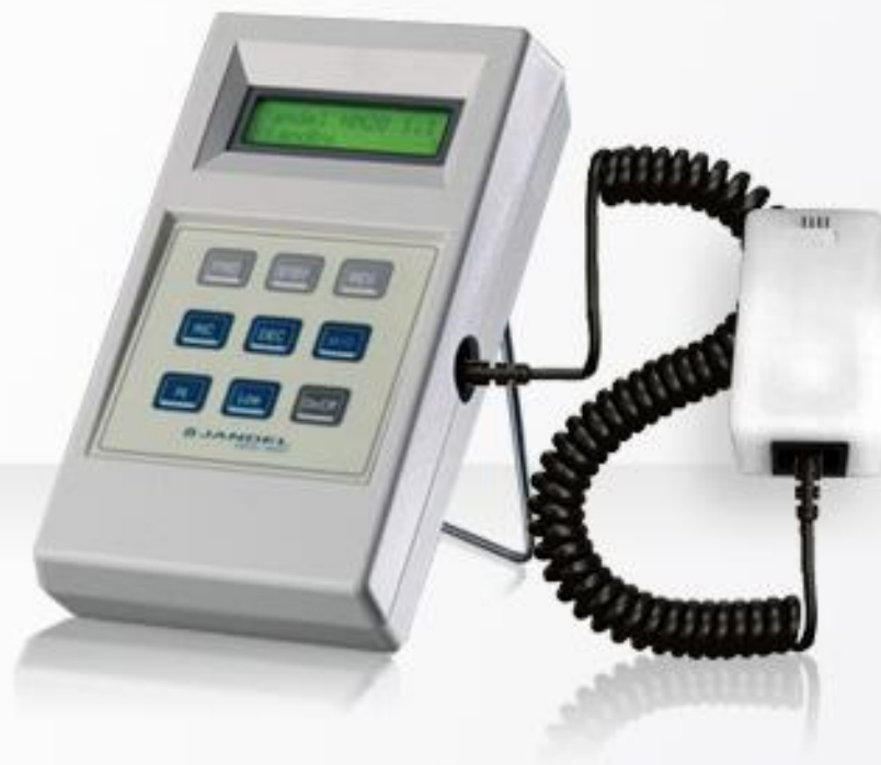
Shown with coiled cable